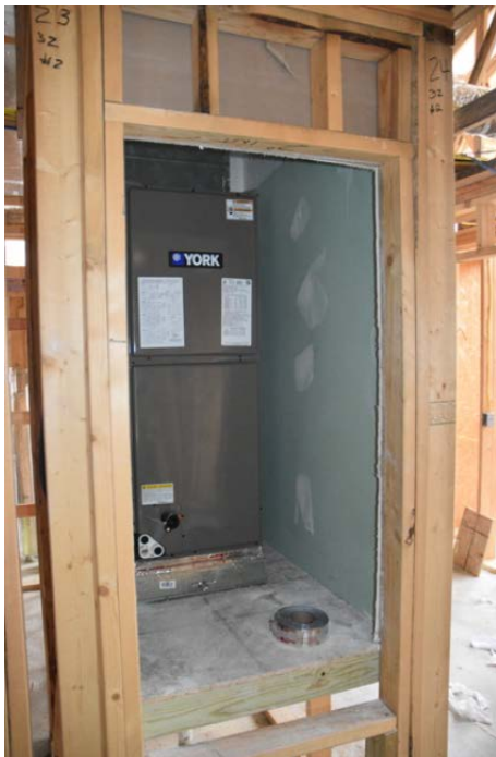
1. York unit installed

Arkansas ASHRAE is committed to building a sustainable culture in our community. We look forward to growing our partnership with Habitat and the vendors who made this project possible.