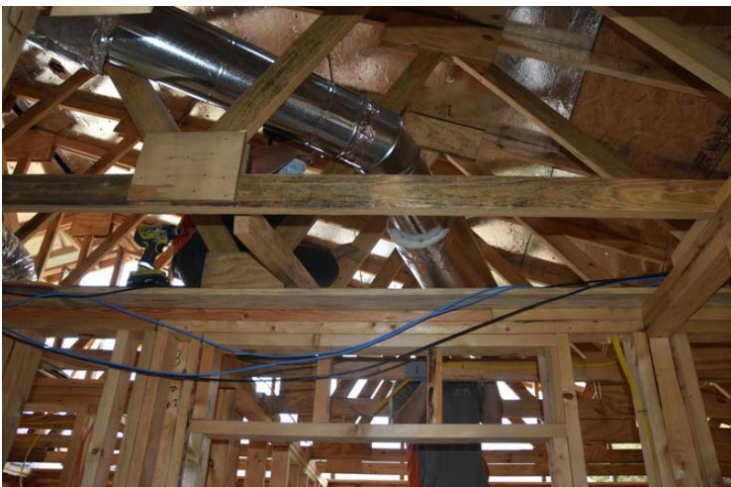
3. Ductwork installation