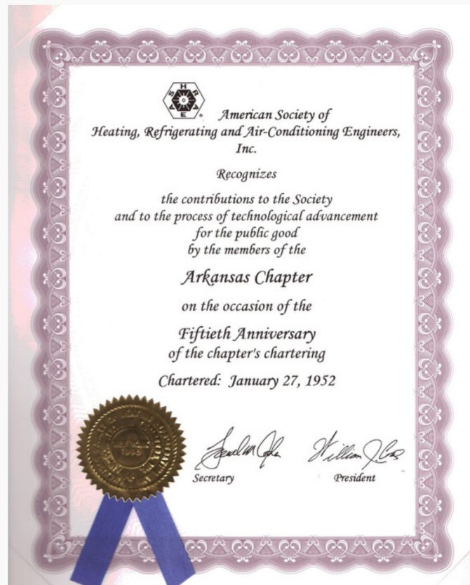
Society recognition of Arkansas ASHRAE's 50th Anniversary (2002).