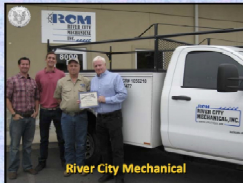
River City Mechanical