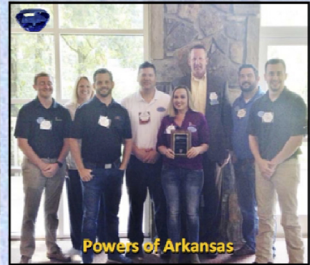
Powers of Arkansas